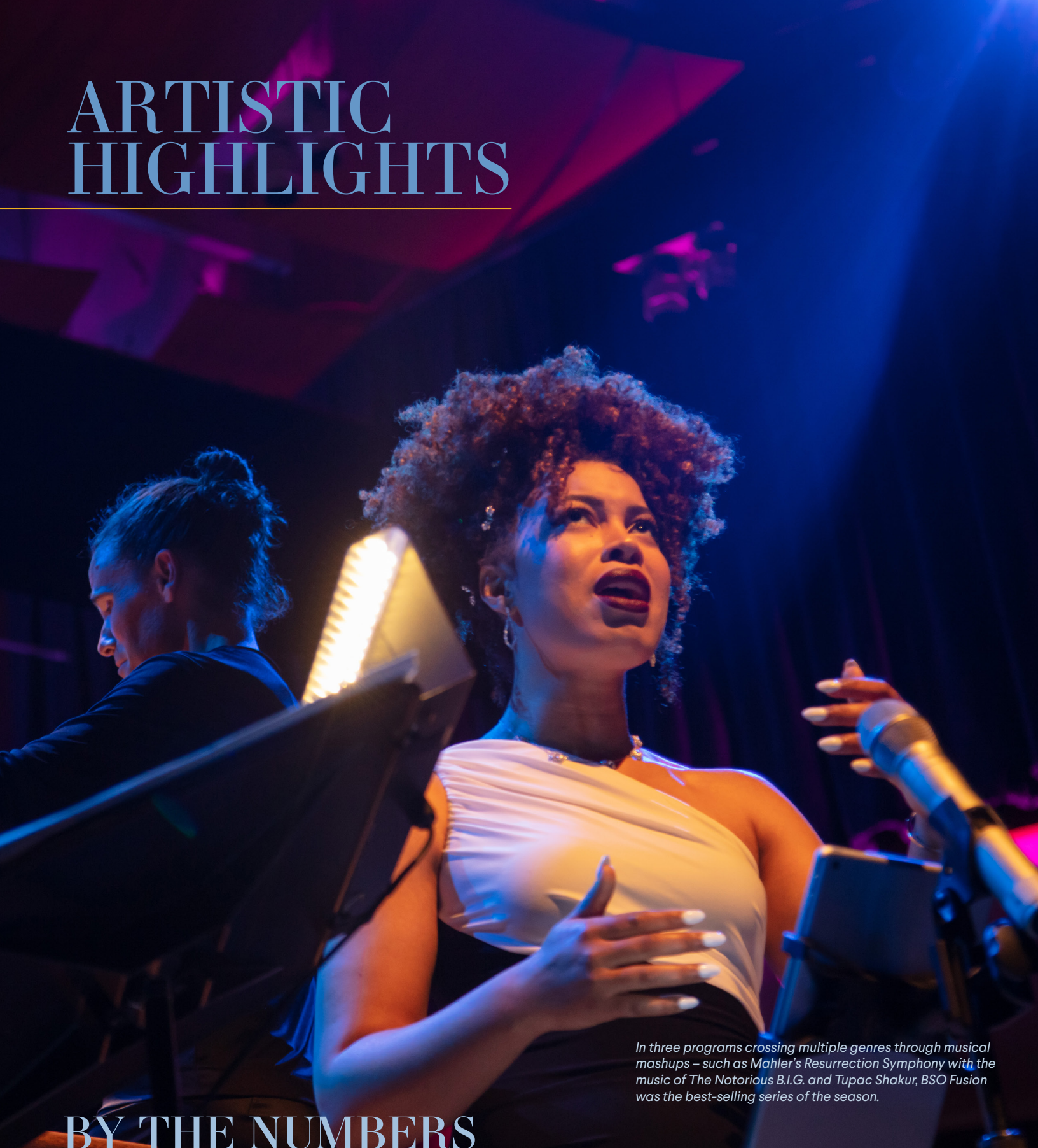
In three programs crossing multiple genres through musical mashups – such as Mahler’s Resurrection Symphony with the music of The Notorious B.I.G. and Tupac Shakur, BSO Fusion was the best-selling series of the season.