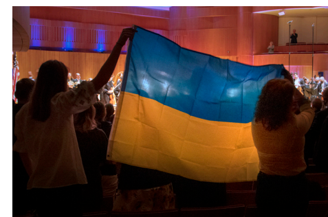
Together with partners at the Creative Alliance, our Ukraine Benefit Concert raised $40,000 in humanitarian funds for the International Rescue Committee.