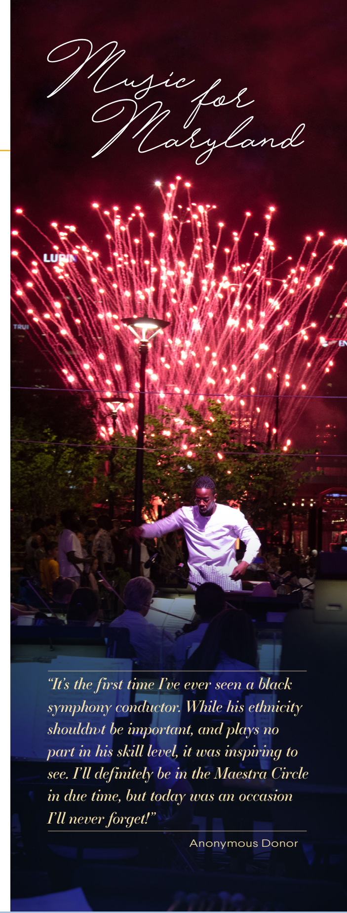
An intern from the Miller Senate Building was among the guest conductors that picked up the baton as we brought our first 'Conduct Me' pop-up to the hallowed halls in Annapolis during Session 2022.

pop-up partnership with GBMC continued to provide respite and recognition to our health workers, and BSO musicians traveled across Montgomery County to share the power of music on Giving Tuesday. We also continued to leverage our Membership Events to intentionally support smaller, minority- and women-owned businesses, including hosting our first Chamber Music event at the White Hall Mill.